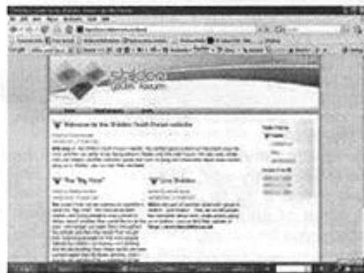
Shildon's Youth Forum website

Shildon's young people now have their very own website.