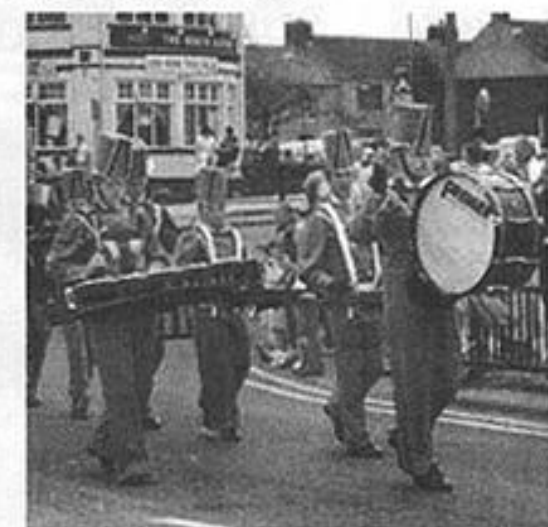
Over 45 jazz bands will parade up Church Street on Saturday August 25th.

Down in Hackworth Park, the area which is commonly home to pub