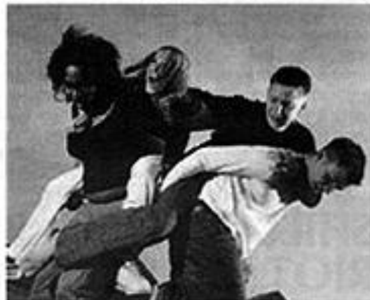
Are local children and young people healthy, happy and well adjusted?

"But it has shown that the majority are "happy and healthy" and if you ask any parent, that is what they wish most for their children."