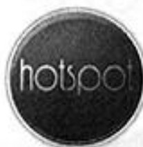
The new, modern café hotspot logo.

If you have any suggestions or questions relating to this, please do not hesitate to e-mail questions@cafehotspot.co.uk .