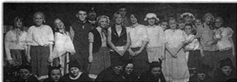
The cast of Sunnysdale's 'Oh Rat's' production. The 'Mayor' and 'Piper' (behind), Towns people (middle) and the Rats (bottom) can be seen here.